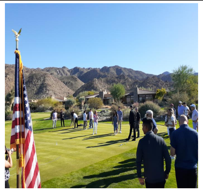
Marine Putting Contest at the Reserve Golf Course in Indian Wells, California